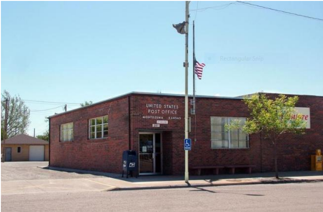
Montezuma, Kansas Main Post Office