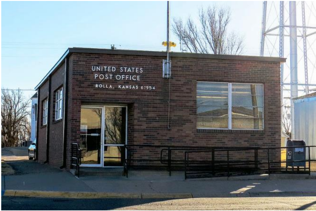
Rolla, Kansas Main Post Office