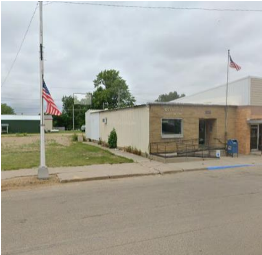
Waubay, South Dakota Main Post Office