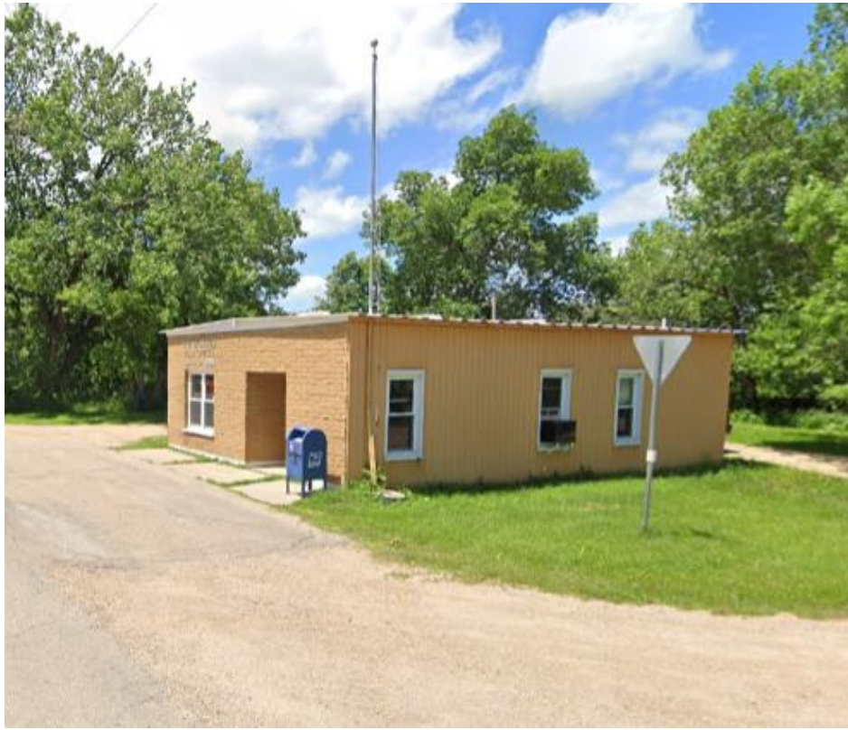
Marvin, South Dakota Main Post Office