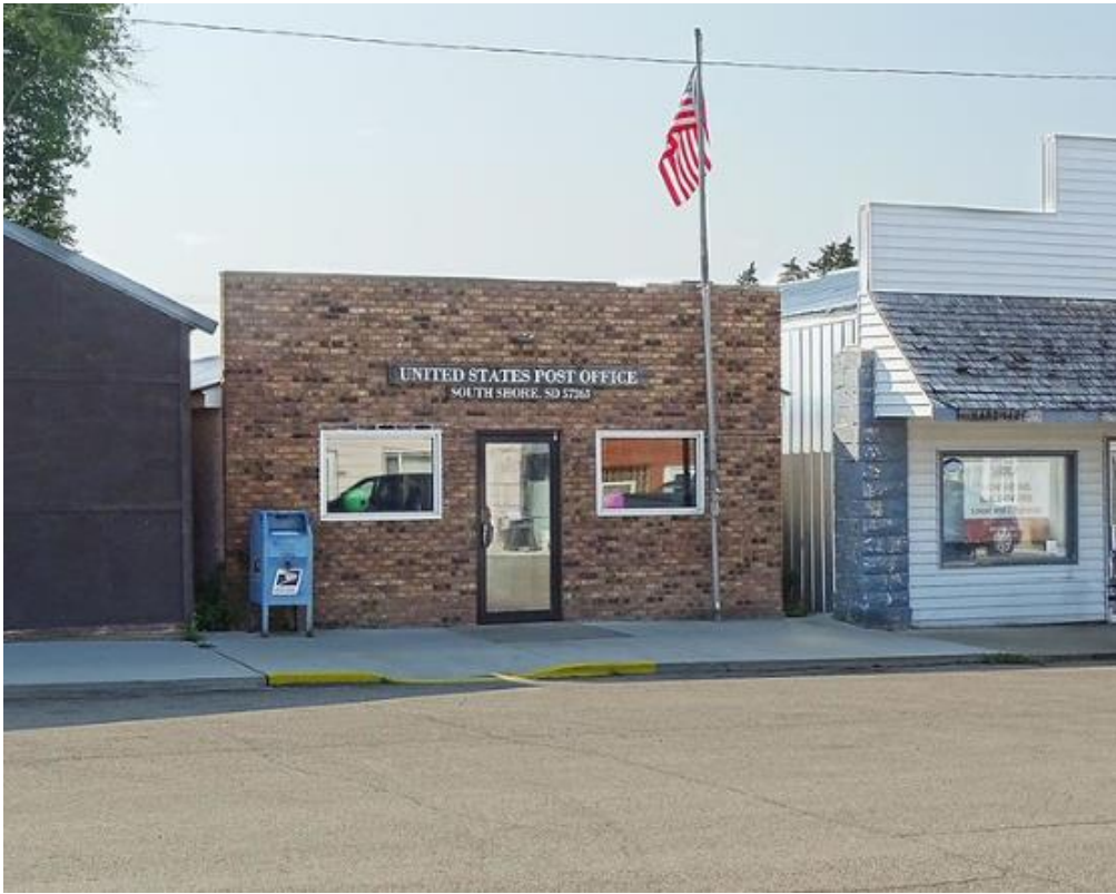
South Shore, South Dakota Main Post Office