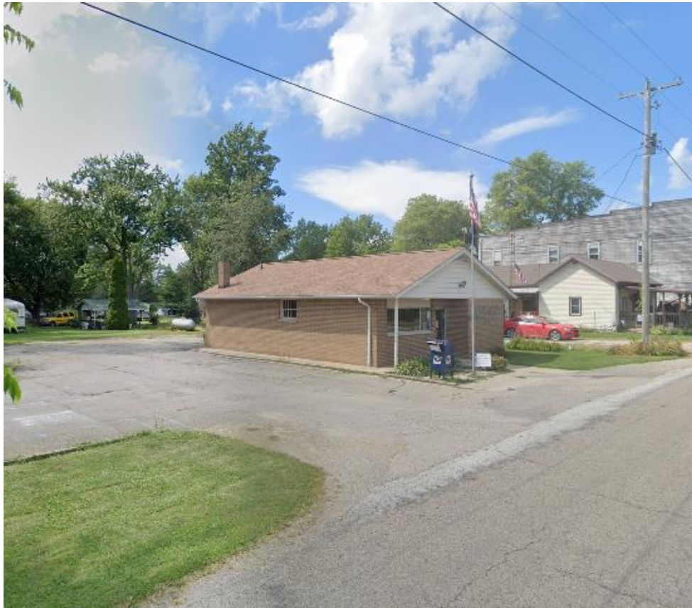
Falmouth, Indiana Main Post Office