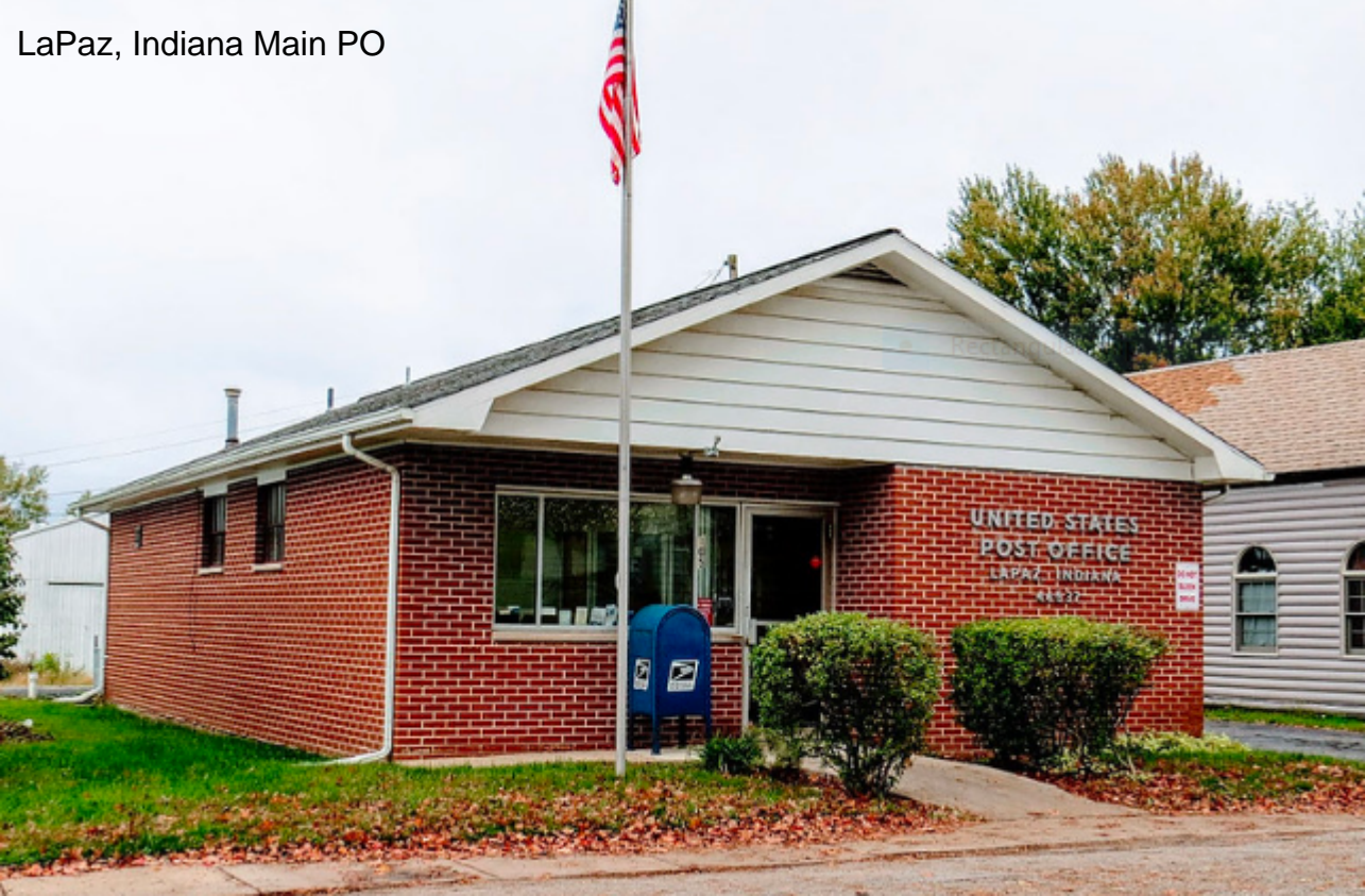
LaPaz, Indiana Main PO