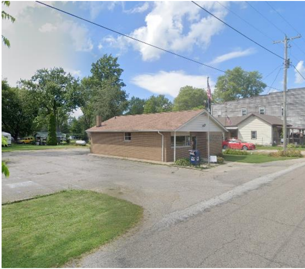
Falmouth, Indiana Main Post Office