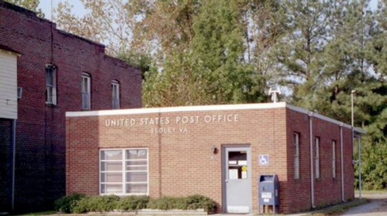
Sedley, Virginia Main Post Office