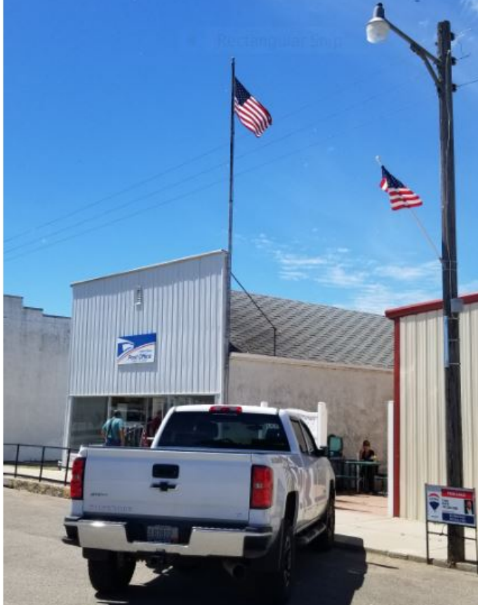
Streeter Main P.O.