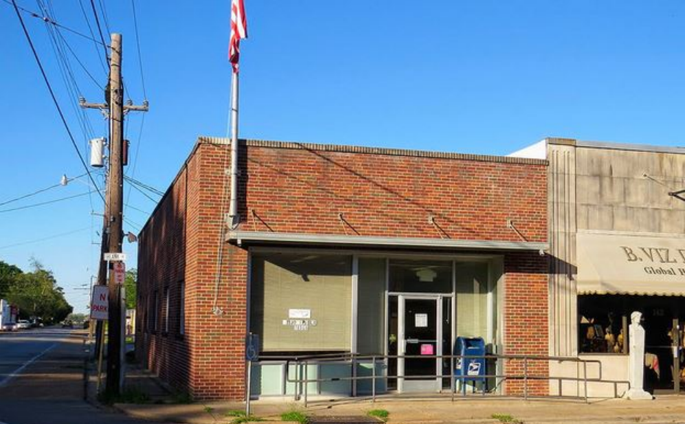
Saint Joseph Main PO